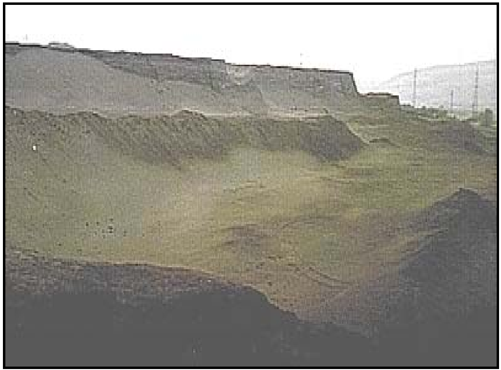
FIGURE 2. FERROUS WASTES FROM AGGLOMERATING PLANTS AND BLAST FURNACES, DEPOSITED IN PONDS

The researches and experiments presented in the paper had as objective a joining of the economical imperative of maximum recovery of a certain ferrous wastes category: dusty (pulverous) wastes, with the social aspect of eliminating pollution in the environment in order to reestablish and maintain environmental equilibrium, and to assure new jobs in a mono-industrial area, disadvantaged because of economical restructuring.