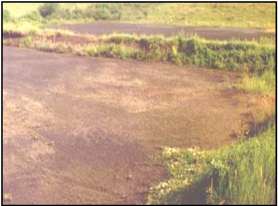
FIGURE 5. POND WITH DEPOSITED PULVEROUS FERROUS WASTES ( II )