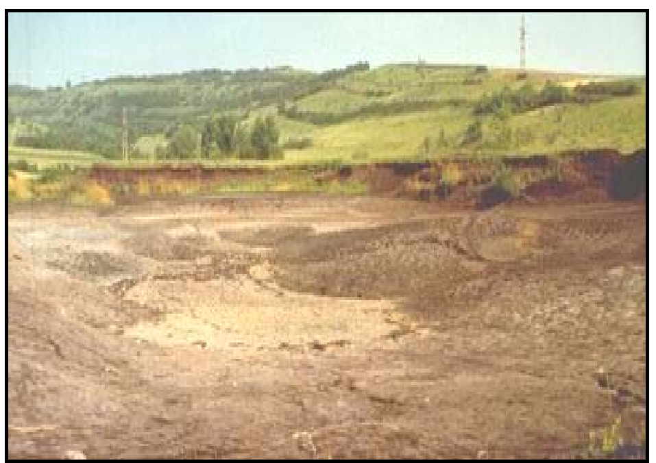
FIGURE 4. POND WITH DEPOSITED PULVEROUS FERROUS WASTES (I)