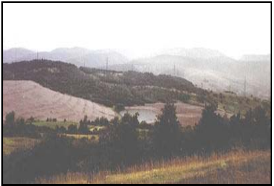
FIGURE 3. PULVEROUS WASTES DEPOSITED IN VICINITY THE CITY

The use of these wastes is important not only because the iron is recuperated and the environment is protected, but also because they exist in a large number: