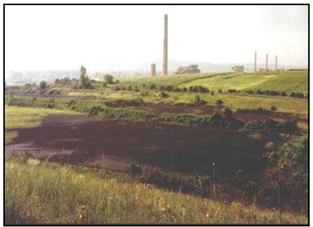
FIGURE 1. PONDS IN THE VICINITY OF THE SIDERURGICA COMPANY HUNEDOARA

In this case, besides the intrinsic value of these wastes as raw materials replacing those produced in the country or imported, another element intervenes: the economical supply in recovering in time the investments for purifying plants.