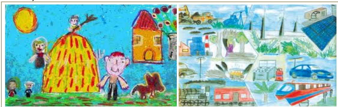
Figure 1. The surface of Children pointing

Now development of life have forced many people to live in buildings and man-made environments and relation of urban human with surrounding environment is pale, in such a way that his daily needs are met in the same environment and his relationship with the surrounding natural environment is for recreation and limited to locations that are defined for that purpose. In fact with choosing urban life, experience and strong feeling of natural environment is weak which their consequence is psychologically significant. In addition to the problem with life of children who live in the city is remarkable. Children relationship with natural environment has been substituted with computer games or eventually is limited to a family outing in that environment. This matter is clear in urban children painting and their difference with rural children painting and this shows dream and wishes of urban children is under the influence of life in city. This matter is remarkable from Phenomenology. This again strengthening of the relationship of urban human life with around the city with nature is felt.