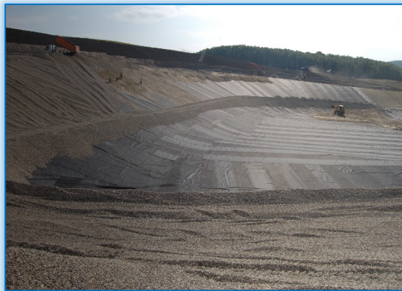
Figure 6. Intermediary phase of central storage unit preparation