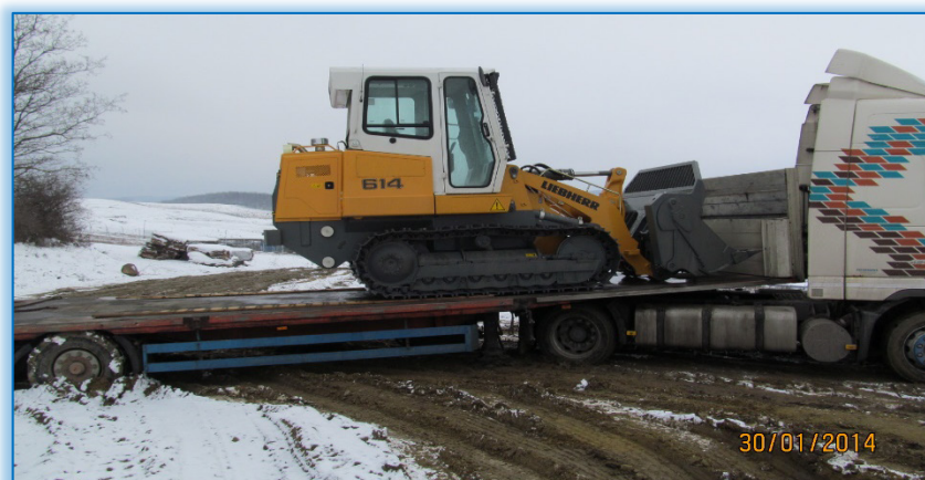
Figure 5. Unincorporated area set up through the project