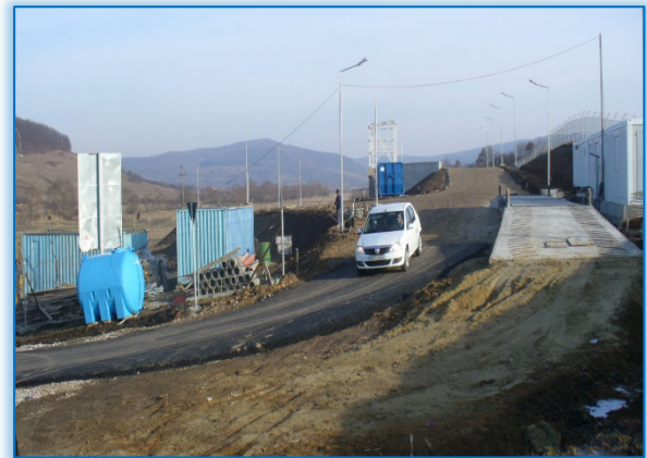
Figure 7. Equipment installation for transfer stations