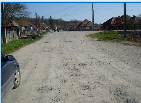
Figure 3. Poor condition of road infrastructure