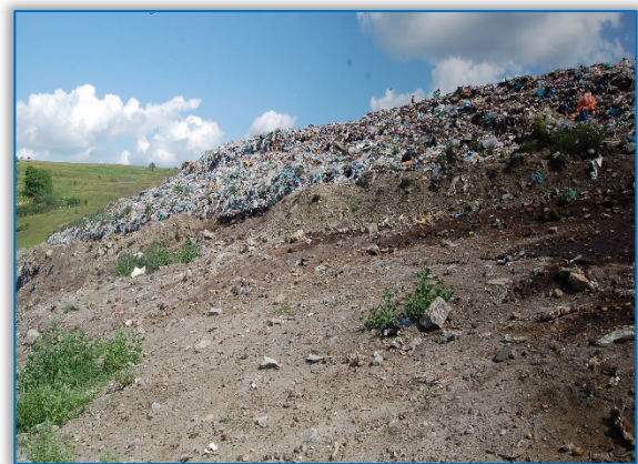
Figure 4. Deplorable condition of the waste storage units