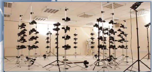
Figure 1. Typical example of photogrammetry scanner

Photogrammetry is technology based on standard photography and projective geometry and was originally used to digitize large objects such as buildings, oil rigs and warehouse. The principle behind photogrammetry is to take multiple images of objects and manually or automatically reference common points in each photograph [3]. Points can be added automatically or manually to create 3D measurements of the desired elements of the part. Typical example of photogrammetry scanner with multiple cameras [4] is described in Figure 1.