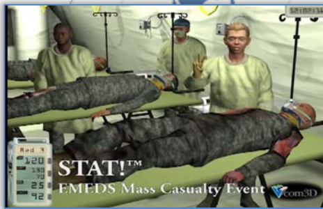
Figure 5. Vcom3D STAT! Trauma Team Trainer – educational game screen shot

Orlando-based company named Vcom3D [10], is leader in providing impressive games and blended reality learning to train critical human interaction skills, Figure 5. Vcom3D [10] developed authentic content using research-based behavioral and physiological models, engage the learner in immersive game play, assess performance in realistic simulations, and provide a collaborative Social Media Framework that enables continuous improvement of learning outcomes.