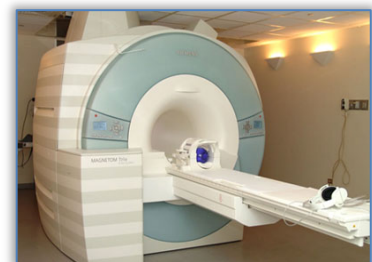
Figure 2. MRI - scanner

MRI scans are obtained by stacking a series of CT [5] or MRI [6] scans on each other in software. This is typically done by precisely controlling the steps in between sectional