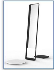
Figure 4. Naked fit set up

Fitness is another branch of 3D body scanning technology which is rapidly growing. People are active, not just because it is healthy, also because they enjoy their well shaped and good looking bodies. Constant scanning of a human body time to time can show progress in its forming and shaping. Currently there are few companies which are developing consumer products in this area. Company Naked [9] has developed a mirror which has built in 3D depth sensors, Figure 4, Intel RealSense Technology. Beside the mirror there is a rotating platform on which the customer stands during scanning, this also allows the setup to measure users weight. User can scan himself whenever he wants and all its data is transferred to his smart phone. This way he can see his 3D avatar, inspect it and compare with previous scans. The setup keeps measure of all users most important measurements and shows changes overtime, allowing to set required assessments and see on which parts of body user should focus.