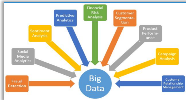
Figure 2 – Big data influences [11]

Sustainability of the concept during the transitional period is an important learning tool for the future activities and mindset of the human that have to accept the concept of Industry 4.0. The resistance for the change may be the greatest