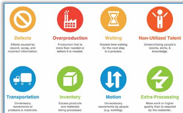
Figure 1 – 8 waste of lean [8]

The general idea of the lean philosophy is reduced of waste [6]. Waste is always somehow present and cannot be eliminated completely, but with help of certain tools it can be minimized. Since the Industry 4.0, the new working environment concept because of the digitalization within the company floor, demands continuous improvements by using data in the real time, lean management is very useful and can be crucial part of it. The transitional process of the company to Industry 4.0 requires complete system scanning [7]. This enables to see all the flows of it and the waste that is generated. To recognize the waste and its impact to minimize or eliminate it the lean philosophy can be very useful. Its definition of seven (eight) types of waste (Figure 1) can help to identify and to reorganize certain departments and processes within the company floor. Each type of the eight categories of waste can be also useful not only in the transitional process, but in the future life of the new company's concept. Reduction of waste will become extremely important since Industry 4.0 demands enormous flexibility, short time-to-market and low expenses in order to produce quality product by relatively cheap price, that would be satisfying for the customer.