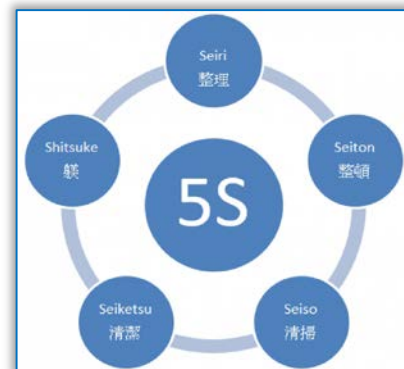
Figure 3 – 5S cycle [13]