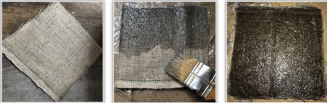
Figure 3. Preimpregnated woven fabrics – manual textile preforming

Composite materials reinforced with woven fabrics, braids, and knits are becoming increasingly popular in various structural applications from automotive, aerospace, furniture, and so on. Processing techniques of materials to obtain composites include technologies to obtain reinforcement layers, stratification technology, transfer resins in textile layers through molding, molding with vacuum/pressure, and autoclaving fabric (reinforcement structures) for impregnation products with properties of thermosetting and compression/preforming molding of thermoplastic and thermosetting composites.