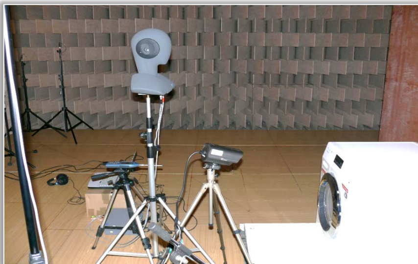
Figure 2. Sound quality measurement of washing machines

Objective evaluation methods of psychoacoustic sound quality based on ratings binaural recordings is made by special measuring devices. These devices are called artificial heads and subsequent software evaluation of the audio signal leads to determination various psychoacoustic parameters (sharpness, roughness, fluctuation, tonality etc.). Sound recordings and records captured by the classic microphones are not suitable for hearing accurate assessment of acoustic environment and sources of noise, as it is lost significant acoustic information such as spatial and directional distribution of noise sources, masking effects, selective hearing, and more. Man is able to locate the source of the noise three-dimensionally in horizontal