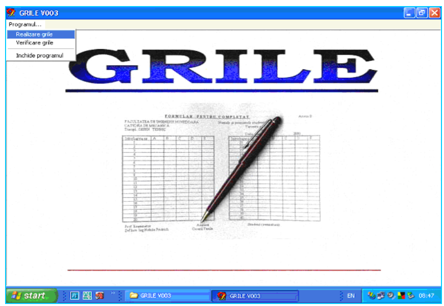
Figure 1. The interface of the program GRILE V003

The program GRILE V003 contains two applications: Realizare grile and Verificare grile. The interface of the program contain a bar of menus which set us six menus with organized options on following category: Programul..., Încarcă..., Salvează..., Nou..., Acțiuni..., Informații generale (in english: The Program..., Load..., Save..., New..., Actions..., General information...).