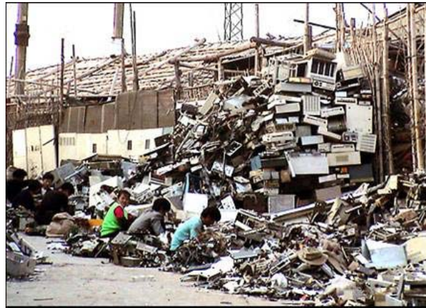
Fig. 2. Waste diversity

Problems that occur in the processing electronic waste arising from products diversity (fig. 3) on the market (difficult collection), diversity of types and manufacturers of similar products, and the unsuitability of products for recycling. Regulations and recommendations on the waste care exist in a number of developed countries (Germany, France, Austria, Switzerland, USA, Japan, etc.). Implementation and enforcement of regulations are assumed associations linking manufacturers, traders of waste.