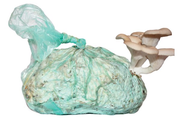
Figure 5 – Experimentation with mushrooms

After the process of oil extraction, 665 kg of exhausted SCG are obtained, that are mixed with 190 kg of bagasse, and they are used as substratum for growing the mushrooms. Even in the cultivation of the Pleurotus Ostreatus mushrooms, outputs of two