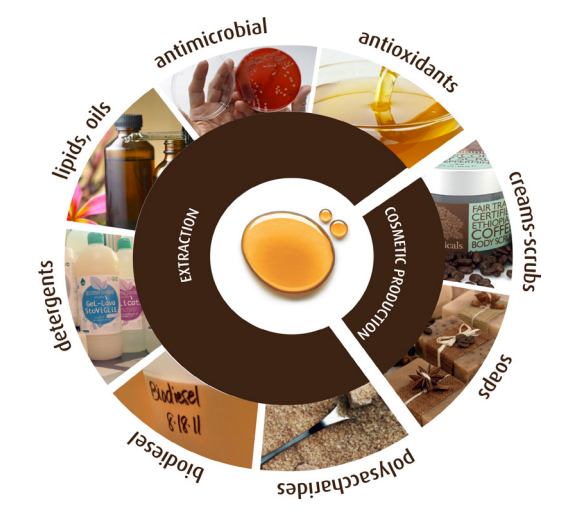
Figure 2 – Application fields of oils

Some universities chemically analysed SCG, pointing out a high presence in them of phenolic compounds with significant antioxidant activity [11;