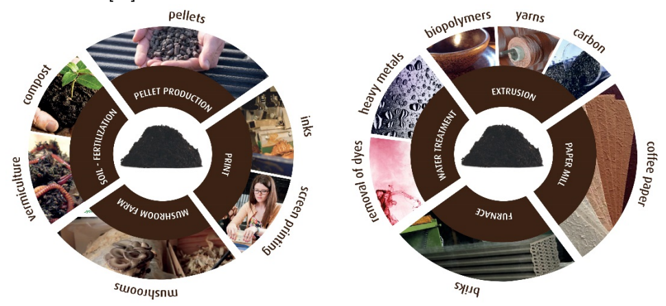
Figure 3 – Application fields of exhausted SCG

12; 13; 14], suggesting the possibility of using the waste as a resource of natural antioxidants or as a source of polysaccharides with an immuno-stimulant activity [15]. By extracting the lipids with supercritical fluid extraction (250 bar at 50°C) they were able to develop new cosmetic formulas [16].