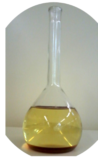
Figure 2. Biodiesel

The result of the transesterification process can be studied visually: Figure 2 shows the stratification. The upper lighter layer (80-90%) is biodiesel, the lower dark layer (10-20%) is the mixture of glycerol, catalyst and alcohol, while the middle milky-like layer is the soap.