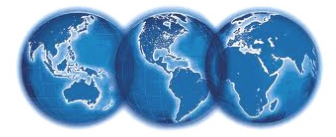
copyright © UNIVERSITY POLITEHNICA TIMISOARA, FACULTY OF ENGINEERING HUNEDOARA, 5, REVOLUTIEI, 331128, HUNEDOARA, ROMANIA <u>http://annals.fih.upt.ro</u>

ANNALS of Faculty Engineering Hunedoara – International Journal of Engineering