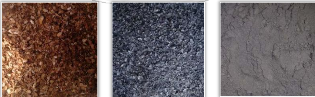
Figure 1: (a) Groundnut Shell, (b) Groundnut Shell Ash and (c) Grinded Groundnut Shell Ash

The groundnut shells (locally available materials) were collected from a milling store at Tsaragi, Edu Local Government of Kwara State. The groundnut shells were burnt to ashes at a temperature of 650°C by Thermolyne Furnace at Foundry and Forging Workshop, Mechanical Engineering Department Federal Polytechnic Offa. The ashes were further grinded to a require level of finer particles with milling machine and allow to pass through sieve No.200 (75 \mu\text{m} ). The groundnut shell, groundnut shell ash and grinded groundnut shell ash are shown in Figure 1 a, b and c respectively.