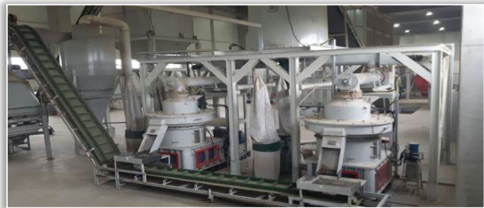
Figure 1 – Ring die pelleting installation used for obtaining pellets