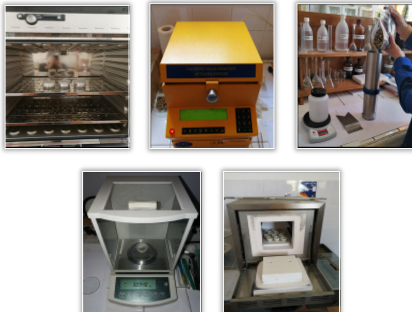
Figure 2 – Aspects during the experiments