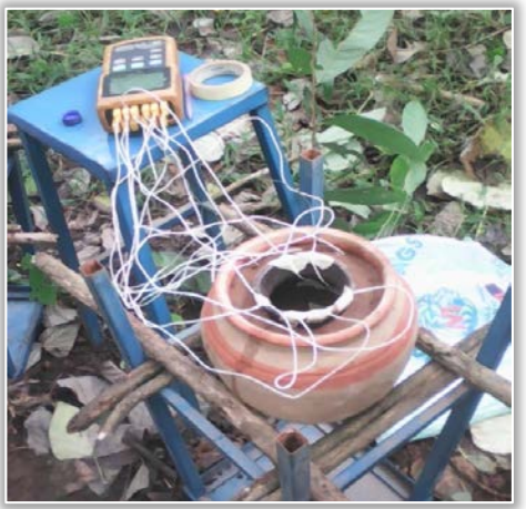
Figure 2: Experimental Set-up

Twelve channel temperature recorder with k-type