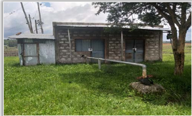
Figure 2: Awaro Campus Water Borehole

The institute of technology campus of the Ambo University which is dedicated to engineering departments, housing more than 7000 students. The existing borehole as shown in figure 2 was working with its full capacity up to 2015. But the borehole was functioning and supplying water to meet the requirements of institute from 2014. After it has been working with the yield of 25-26litre/sec at the time of construction was reduced to 14-15 liter/sec. Because of this, maintenance and borehole washing has been done, so by doing this restarted to function the institute up to the end of 2015 but without much working, because of getting reduced yield capacity of the borehole decided to stop function.